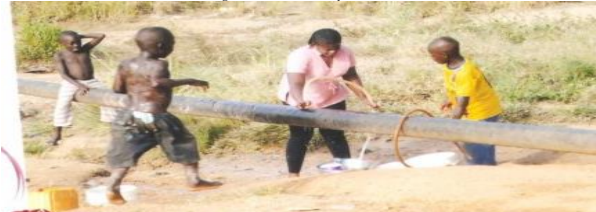
Plate1: People Siphoning Water from Water Main near Gudun in Bauchi