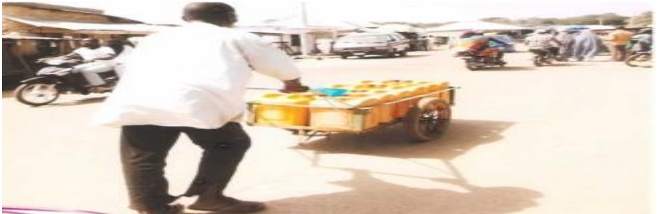
Plate 2: Water Hawker along Wunti Market